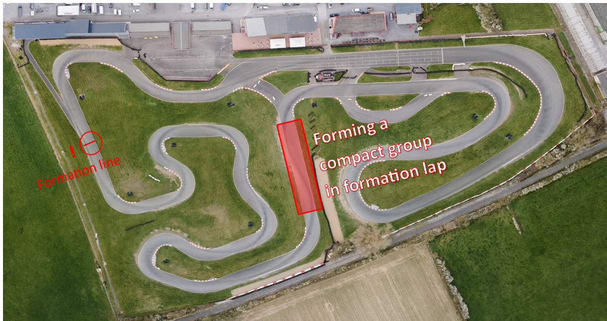
Figure 2. Top view Mariembourg. Formation details.